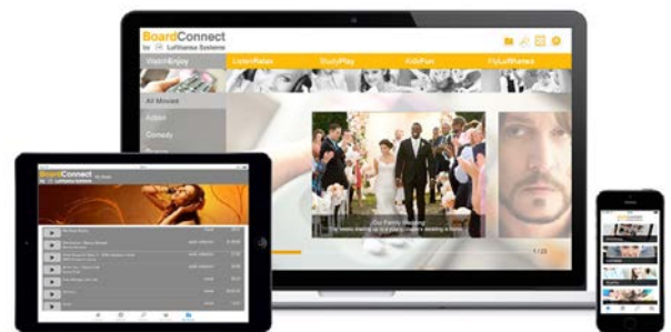
Lufthansa Systems BoardConnect